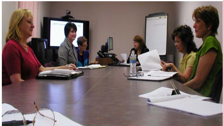
Members of the JobLink Leadership Team met recently to update the Memorandum of Understanding.

The following figures have been compiled from monthly reports as taken from the daily sign-in logs. For the 2nd Quarter of 2009, Thomasville JobLink had a total of 4,008 customer visits, with 994 being new customers. The total number of job placements for this quarter was 84, with 49 employer contacts and 28 services to businesses.